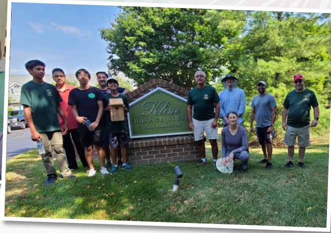
Boy Scout Troop 470